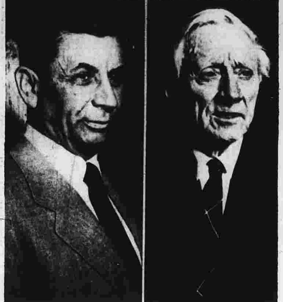
Meyer Lansky, left and U.S. Supreme Court Justice William Douglas. A deal set up by underworld figure Lansky reportedly helped finance a foundation Douglas headed.

The Weather Cloudy, windy, cold this afternoon with showers likely, turning in low 50s. Cloudy, windy, cold tonight, low around 30.